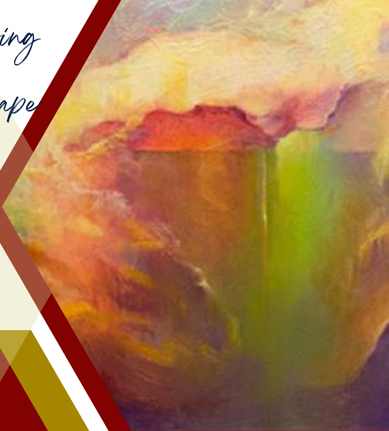
Featured Image: Cascade